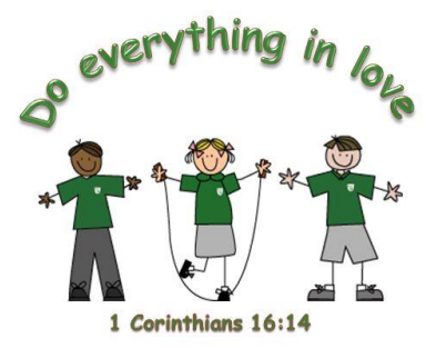
Learning to Love, Loving to Learn